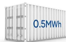
Standard 20ft containers