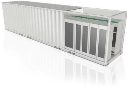
Photo-Powered Electrochemical Energy Storage

The last ten years have witnessed a significant increase in the development of integrated devices, and among all, solar cells paired with electrochemical energy storage (EES) devices have ...